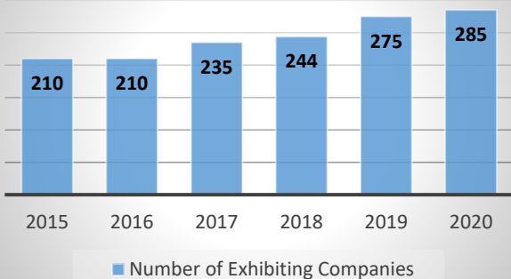
Number of Exhibiting Companies

Recipient of 4 Trade Show Executive's Fastest 50 Awards! On the list of the fastest growing trade shows in the U.S.